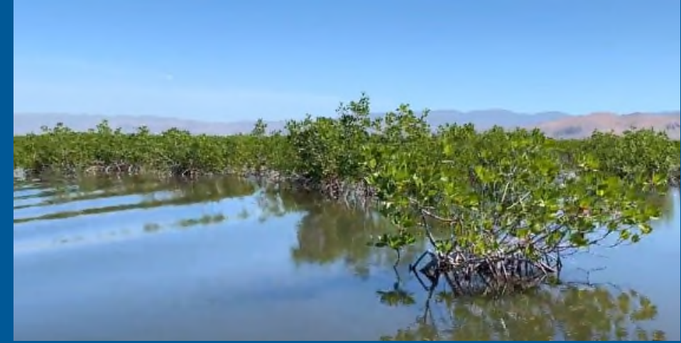
IUCN grant for a mangrove <u>rehabilitation project in</u> Gonaives in 2021

Mission: To support concrete climate change mitigation and adaptation infrastructure projects in waste management in developing countries through: