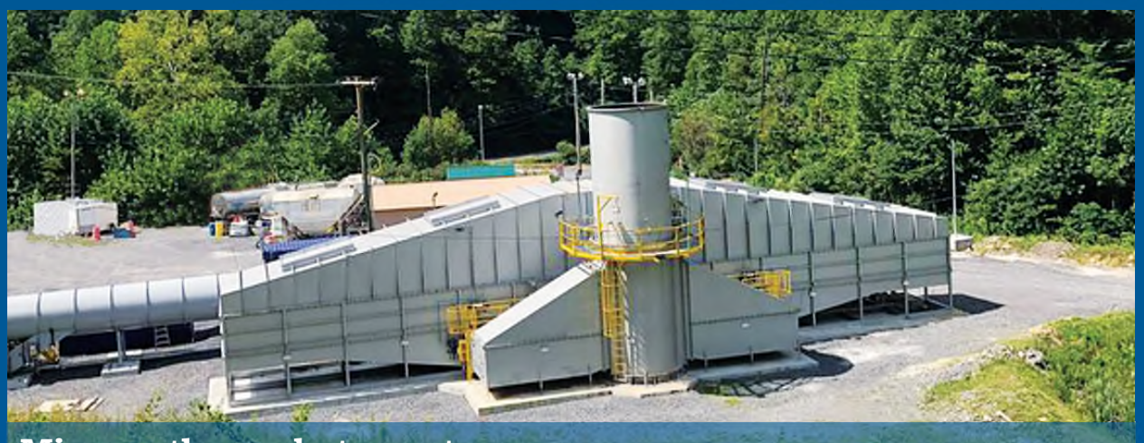
Mine methane abatement Full-scale Vamox® Technology (Virginia, USA, 2022)