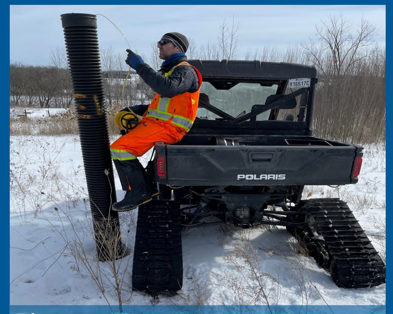
Biogas Services Biogas sampling in a landfill site (Quebec, 2022)

Since early 2022, Biothermica has been enrolled in a global network of supply chain risk management (Veriforce, ISNetworld), compliance and ESG valuation services.