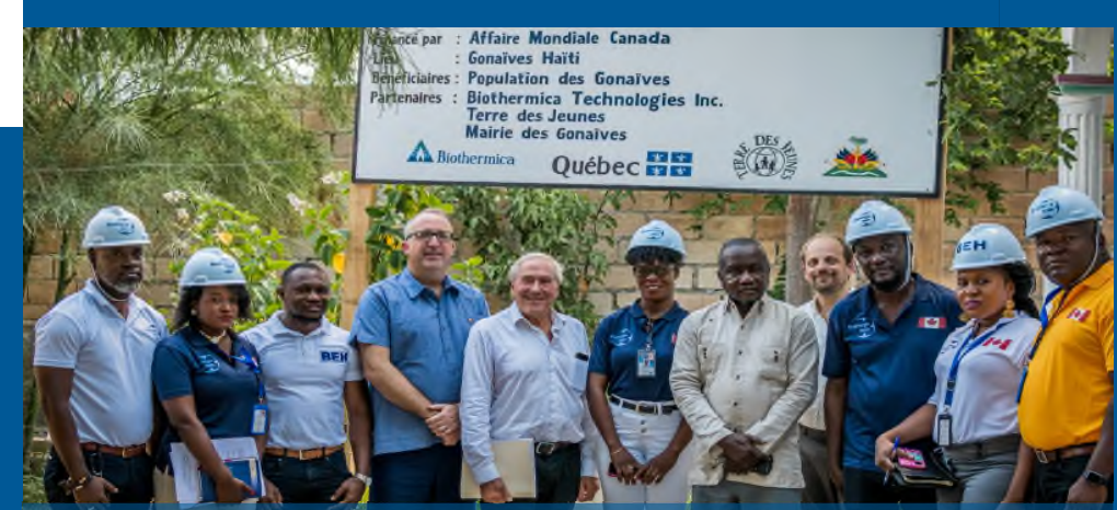
Energy recovery from waste methane Visit of the Canadian ambassador (Gonaives, 2022)